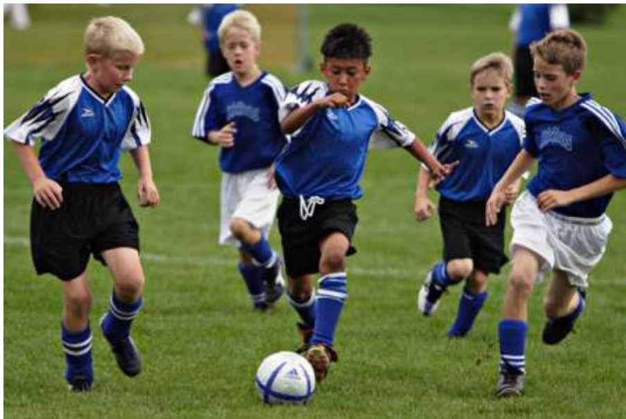
Children are running towards a ball.